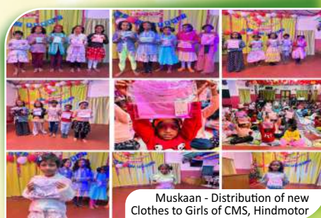
Muskaan - Distribution of new Clothes to Girls of CMS, Hindmotor