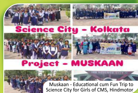
Muskaan - Educational cum Fun Trip to Science City for Girls of CMS, Hindmotor