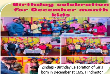
Zindagi - Birthday Celebration of Girls born in December at CMS, Hindmotor