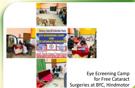
Eye Screening Camp for Free Cataract Surgeries at BYC, Hindmotor