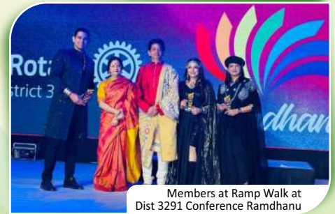
Members at Ramp Walk at Dist 3291 Conference Ramdhanu

Kudos to RC Calcutta Yuvis for sponsoring the new club.