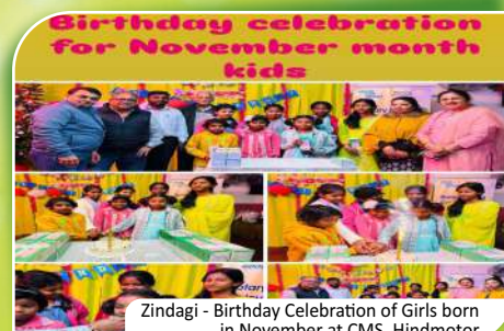
Zindagi - Birthday Celebration of Girls born in November at CMS, Hindmotor