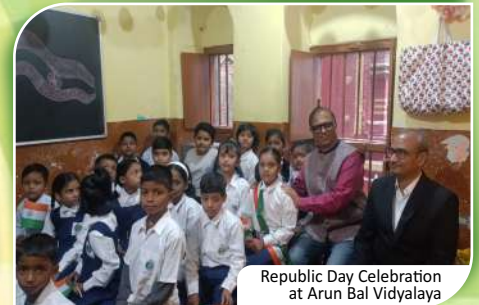
Republic Day Celebration at Arun Bal Vidyalaya