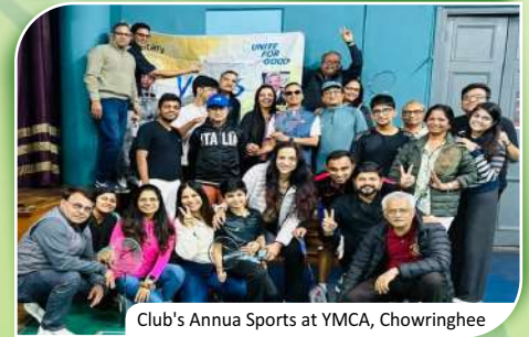
Club's Annual Sports at YMCA, Chowringhee